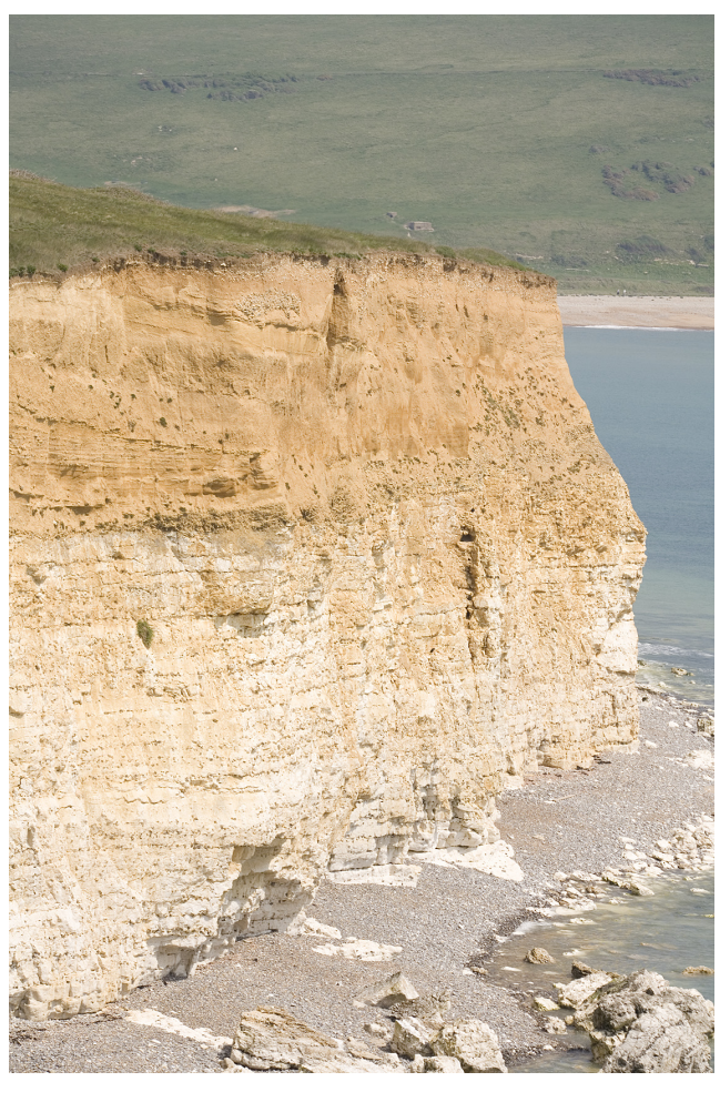
Photo 4 (below). Two small cliff falls, such as this one to the west of Cow Gap, allowed access to small nest sites.

Photo 3 (right). Most of the nesting sites were in Loess deposits in situations like this. There were also frequent patches of Kidney Vetch on the near-vertical face.