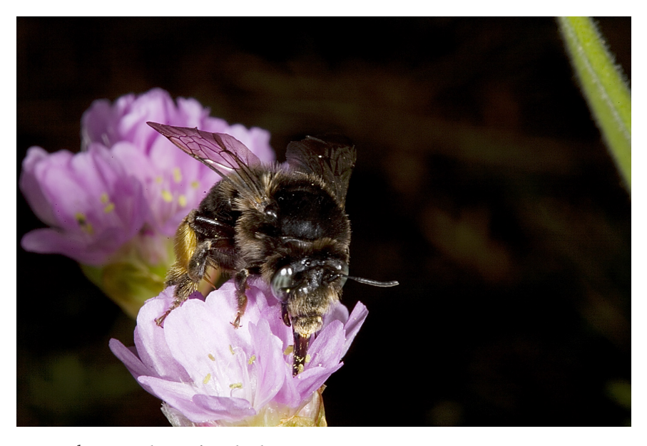
Investigation into the autecology of Anthophora retusa, 2008. 1