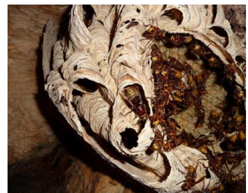
A hornets' nest. The beige coloration and blistery bulges are diagnostic

Hymettus Ltd is the premier source of advice on the conservation of bees, wasps and ants within Great Britain and Ireland.