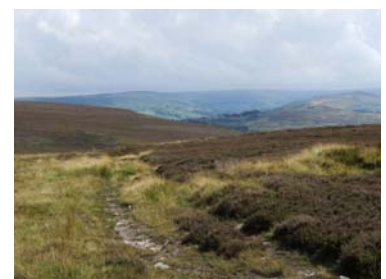
Classic Colletes succinctus habitat in the North York Moors.

Hymettus Ltd is the premier source of advice on the conservation of bees, wasps and ants within Great Britain and Ireland.