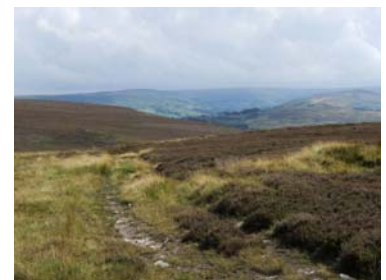
Classic Colletes succinctus habitat in the North York Moors.

Hymettus Ltd is the premier source of advice on the conservation of bees, wasps and ants within Great Britain and Ireland.