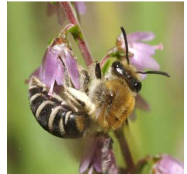
Colletes succinctus female foraging for pollen at Heather